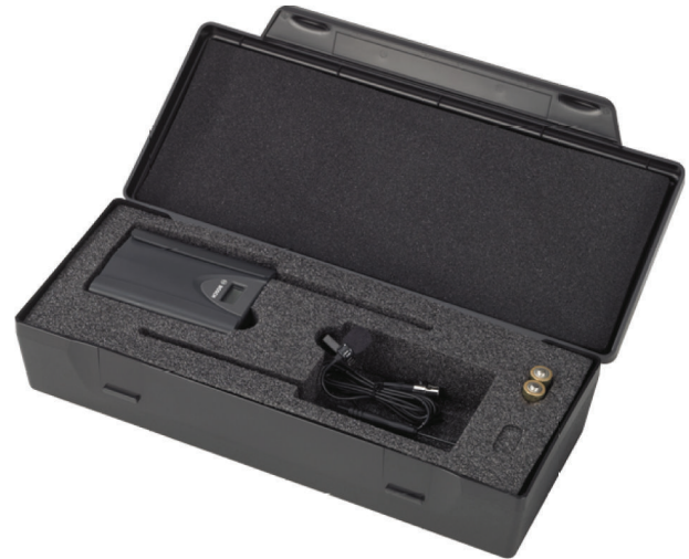
Protective case with wireless, belt-pack and accessories