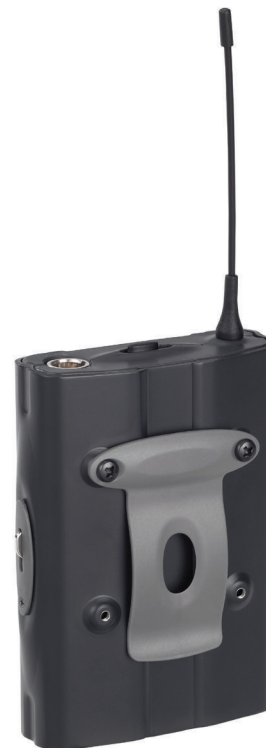
Belt-pack rear view