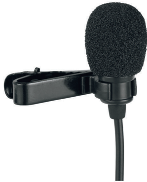
Lavalier microphone with clip