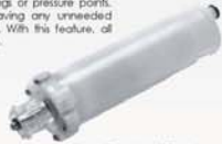
Speed Reduction (SR) and Self-Lock (SL) Safety System

The design of the system allows the screen to be positioned at any desired point with virtually no limitations. With this design, when the screen is retracted into the casing there are no springs or pressure points. This prevents the screen from having any unneeded stress points which cause wrinkles. With this feature, all Grandview screens are wrinkle free.